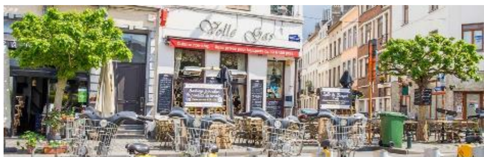
RESTAURANT VOLLE GAS

https://restaurant-volle-gas-bruxelles.be/